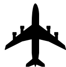
19. Commercial Jet